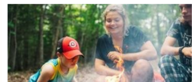
D-Camps encourages kids to indulge their sense of fun and adventure in a diabetes-friendly environment